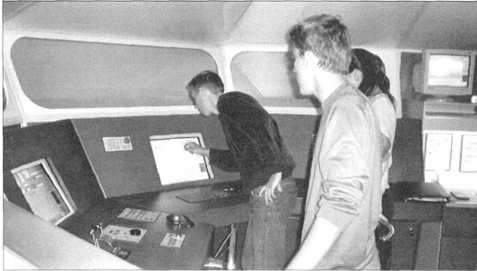
Figure 2 – Students’ team during “Integration of Nautical Information” course laboratory

It is true that nowadays, due to technological advances, navigating a ship has become theoretically easier; thus, the burden on the maritime officer has been decreased, allowing him to concentrate on safe navigation, while future technologies are going to improve safety standards and ease the navigation effort even more. However, we encourage students not to rely too much on the information available from electronic sources like the ECDIS or the radar, but rather to “look out the window” and “take a look around”, to use their senses, as well as making good use of what today’s technology has to offer them